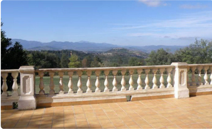
View from the terrace of the «Domaine Peyre Picade» towards Rennes-le-Château and the Pyrenees

The atelier will take place in Occitania in Southern France on the estate «Domaine Peyre Picade», in 11190 Coustaussa. It is located 4 km from Rennes-le-Château, surrounded by meadows, old trees and forest.