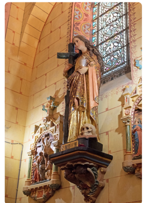
Church of Mary Magdalene in Rennes-le-Château